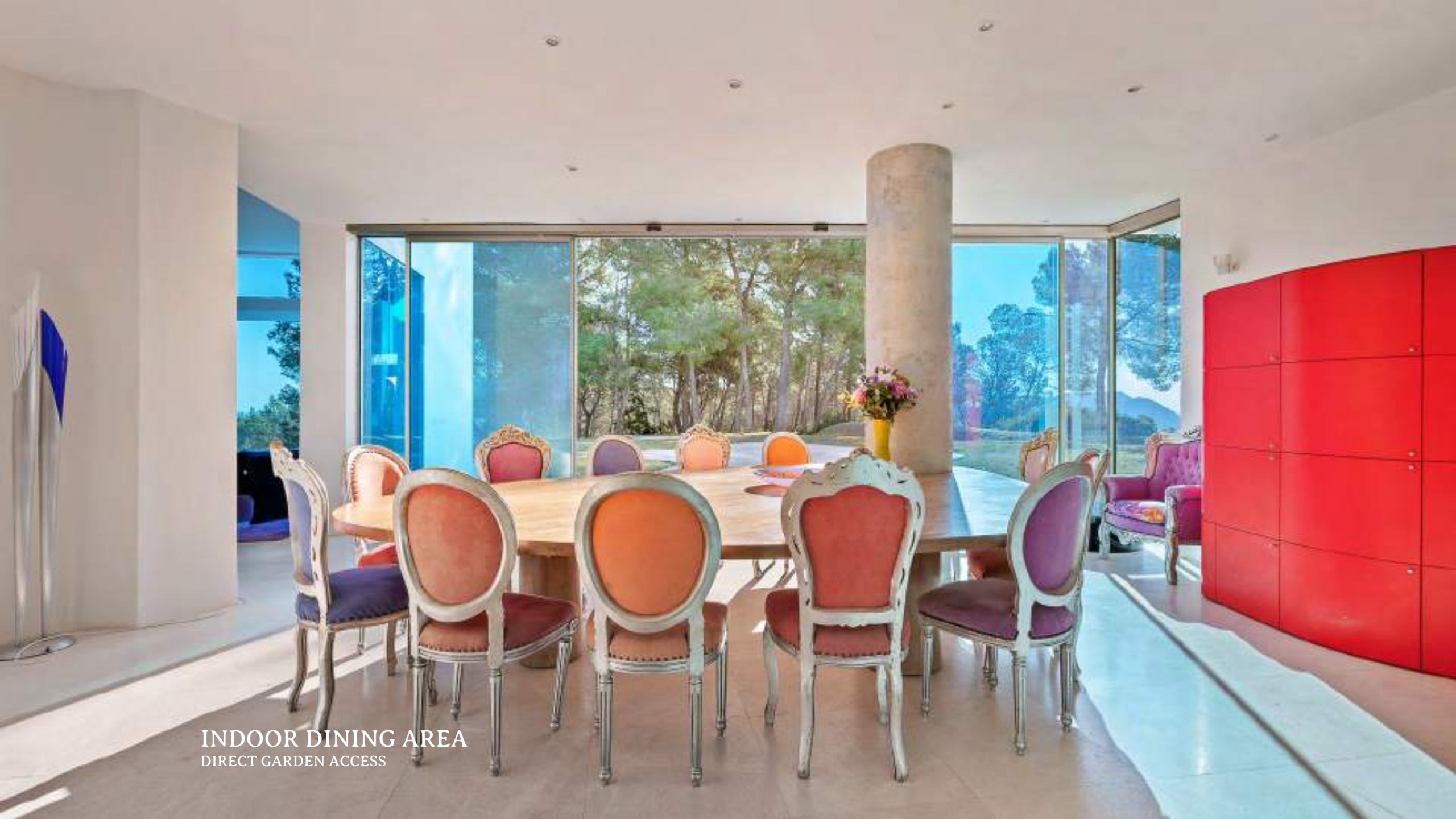
INDOOR DINING AREA DIRECT GARDEN ACCESS