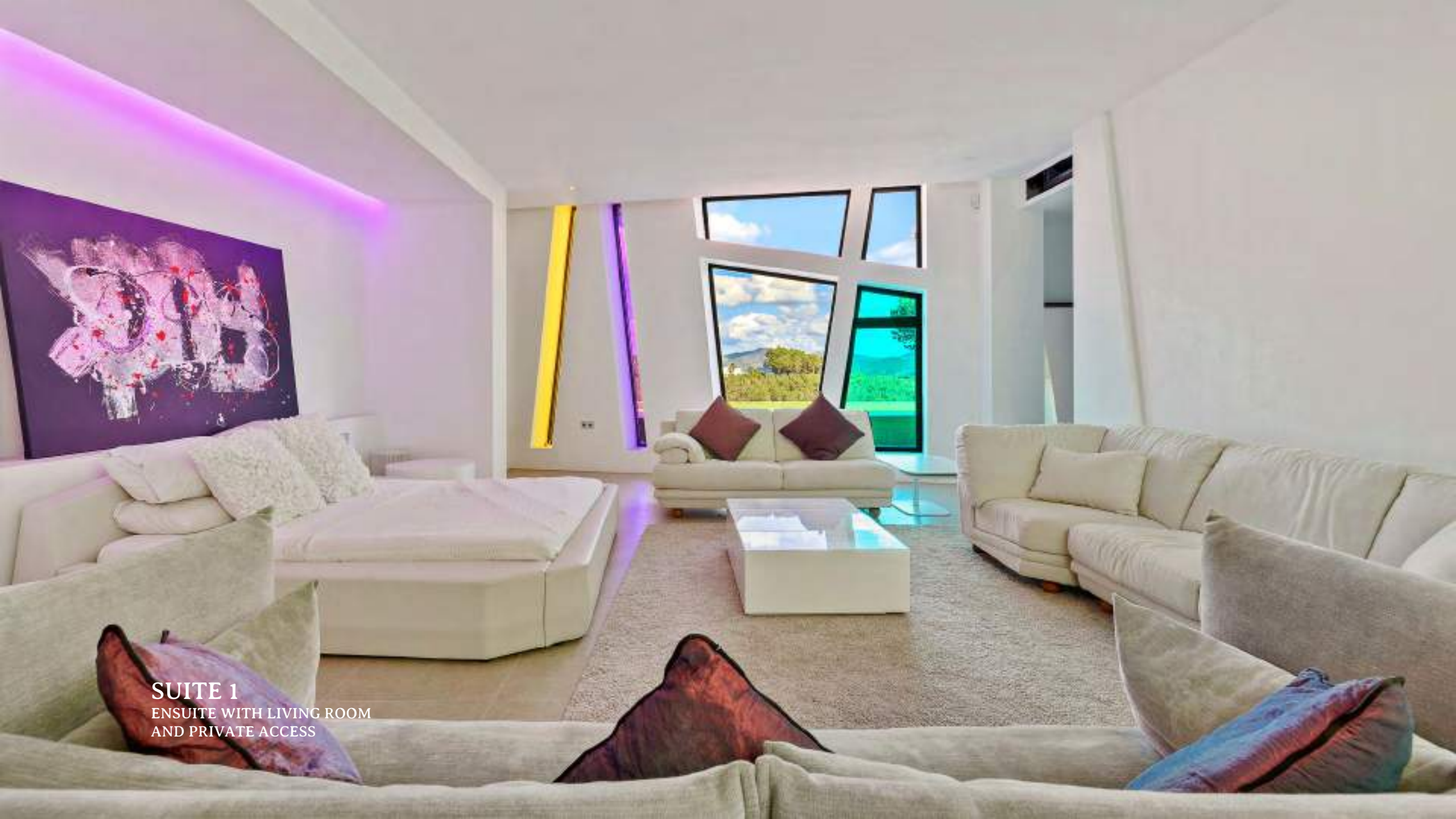
SUITE 1 ENSUITE WITH LIVING ROOM AND PRIVATE ACCESS