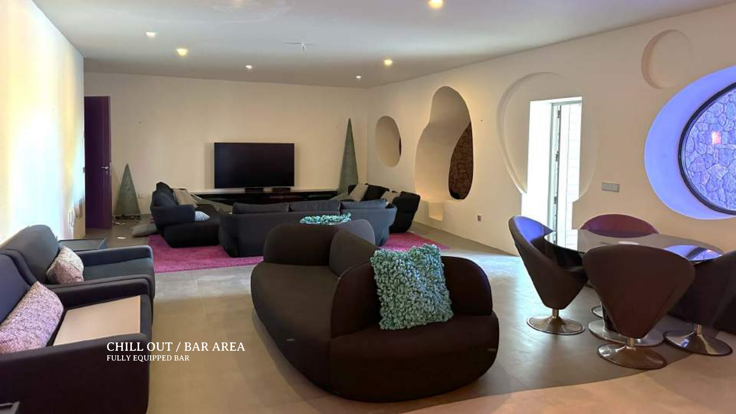
CHILL OUT / BAR AREA FULLY EQUIPPED BAR