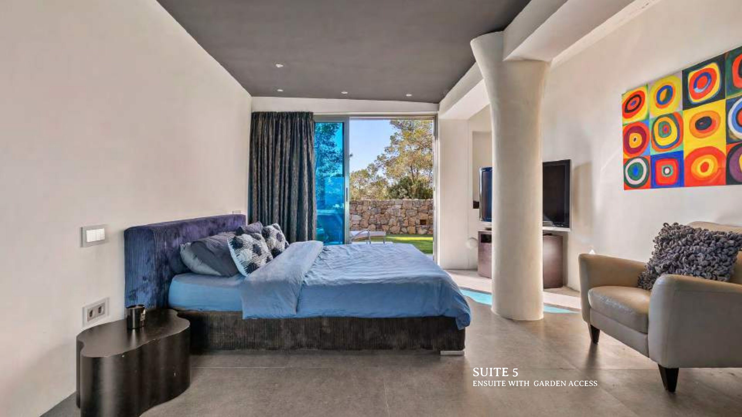
SUITE 5 ENSUITE WITH GARDEN ACCESS