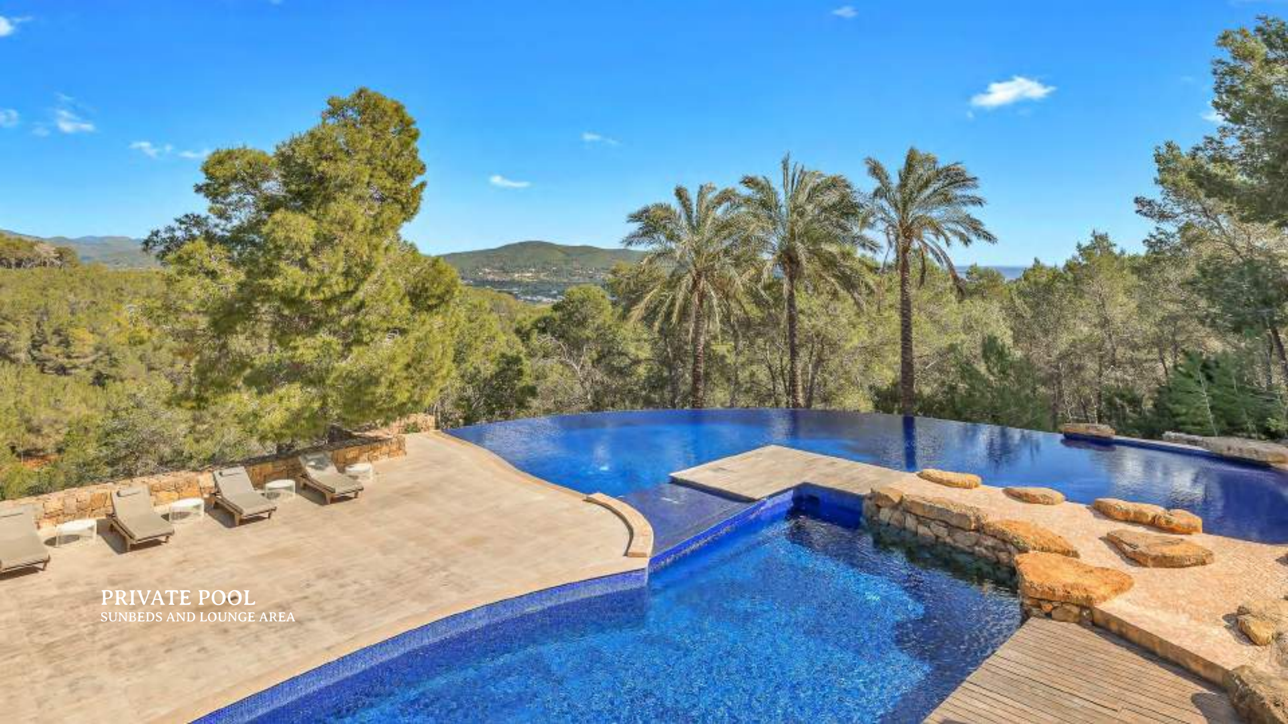
PRIVATE POOL SUNBEDS AND LOUNGE AREA