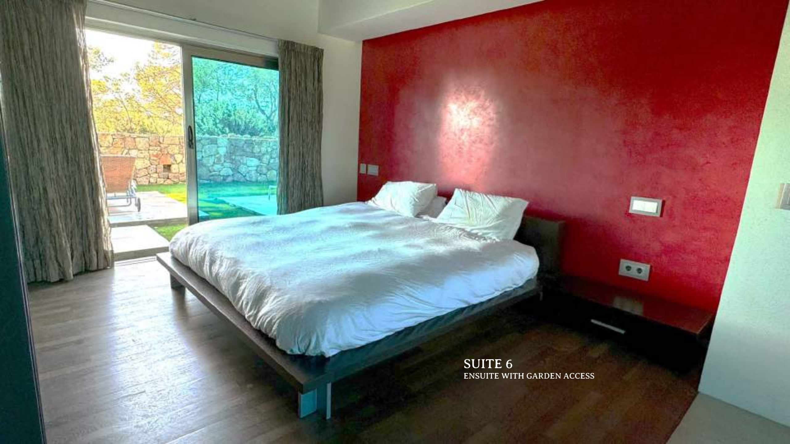
SUITE 6 ENSUITE WITH GARDEN ACCESS