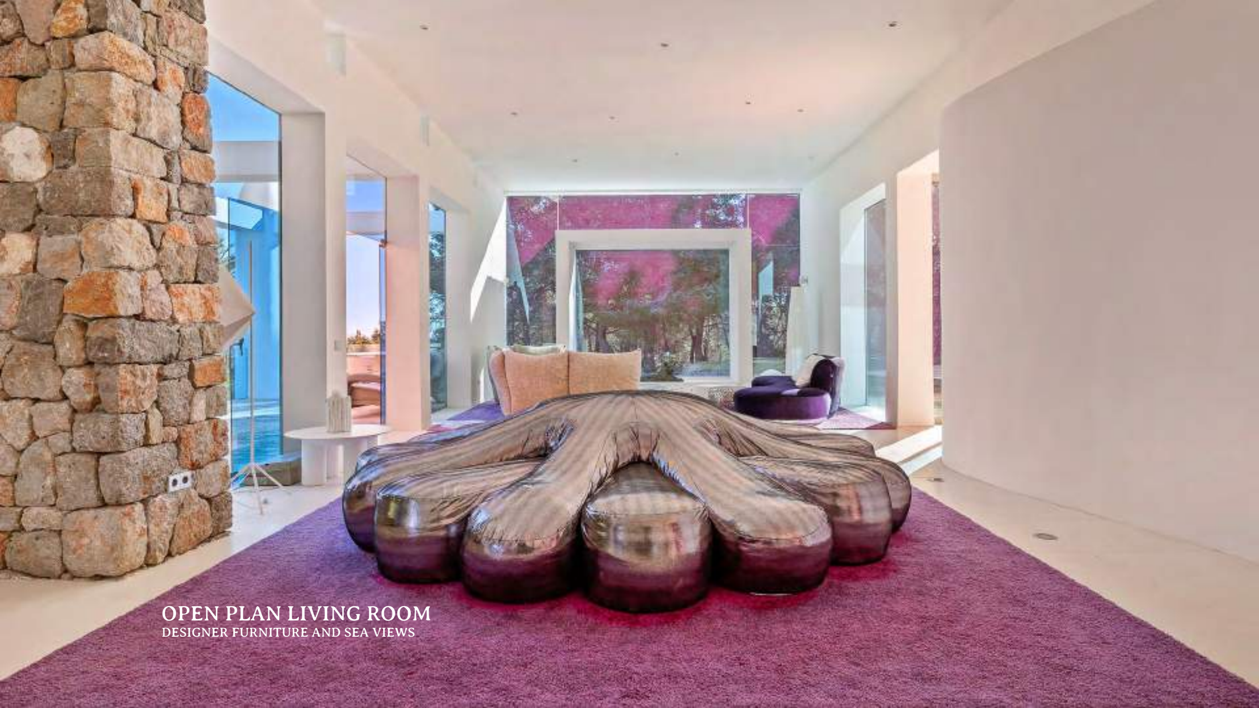
OPEN PLAN LIVING ROOM DESIGNER FURNITURE AND SEA VIEWS