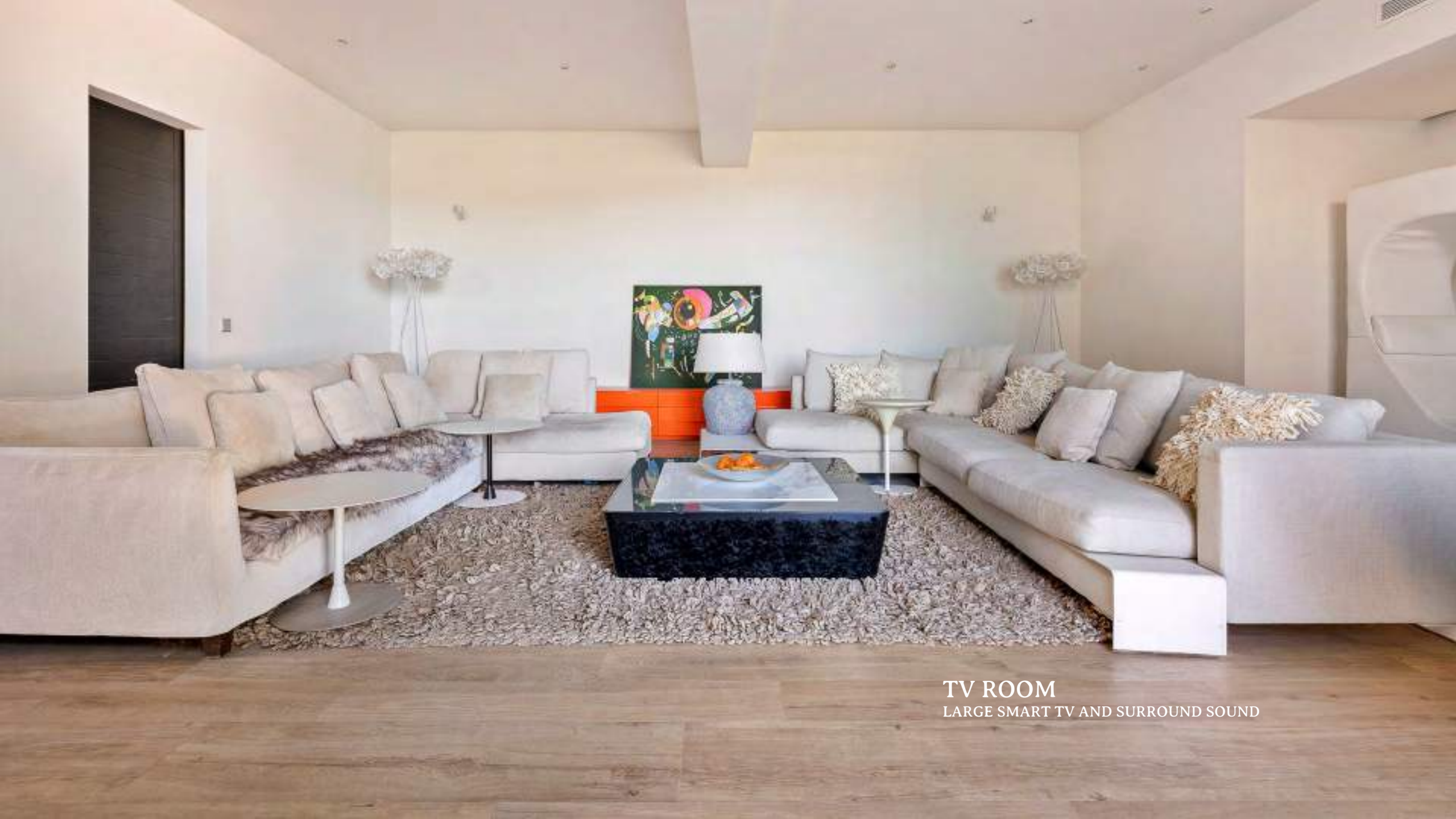
TV ROOM LARGE SMART TV AND SURROUND SOUND