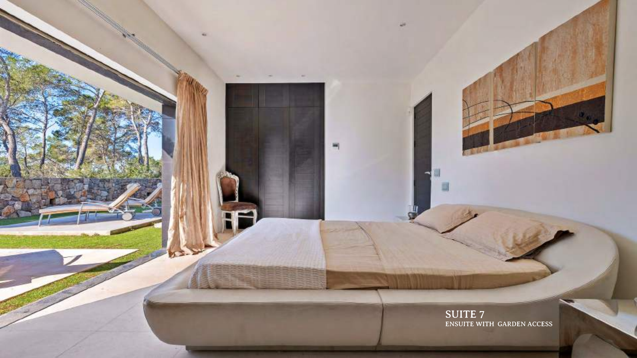
SUITE 7 ENSUITE WITH GARDEN ACCESS