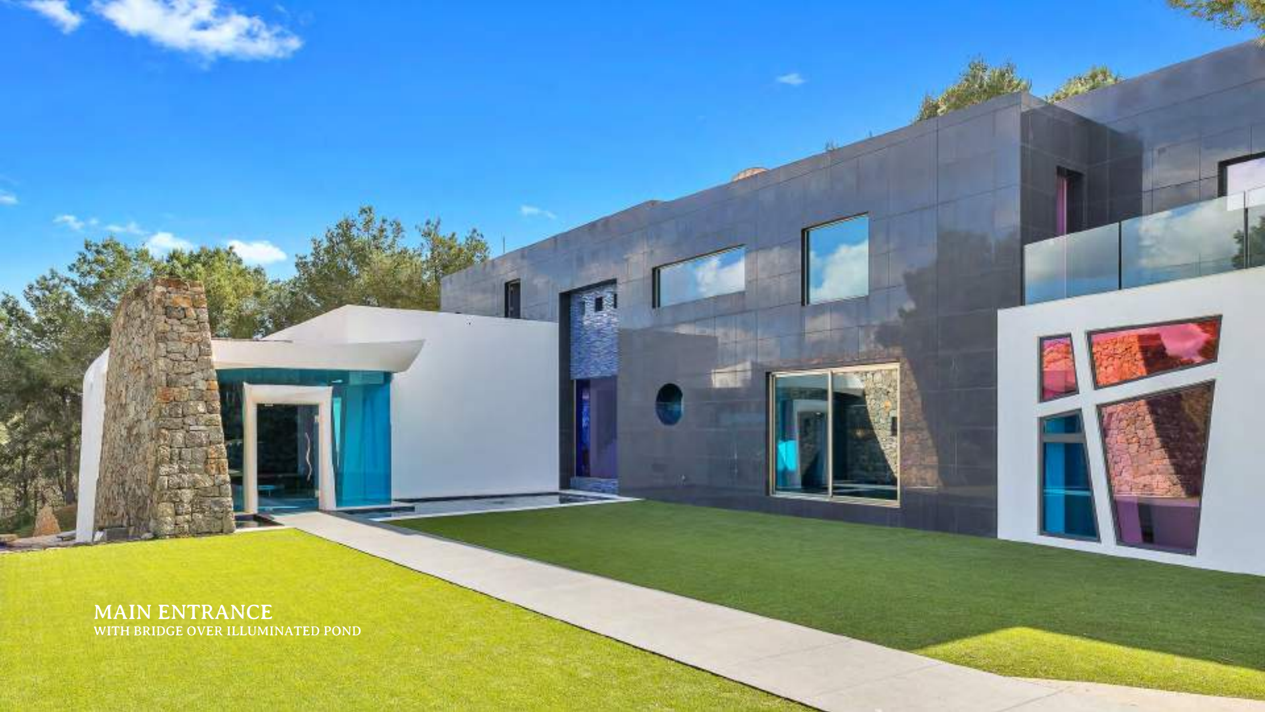
MAIN ENTRANCE WITH BRIDGE OVER ILLUMINATED POND