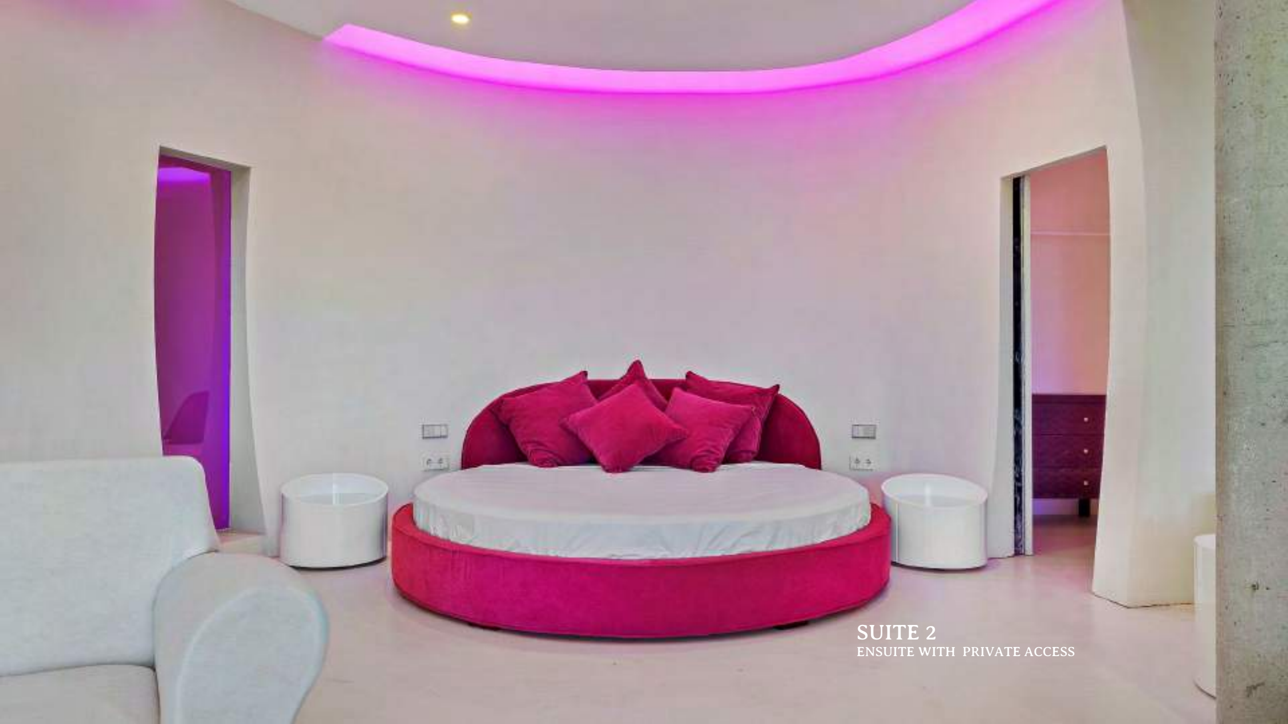
SUITE 2 ENSUITE WITH PRIVATE ACCESS