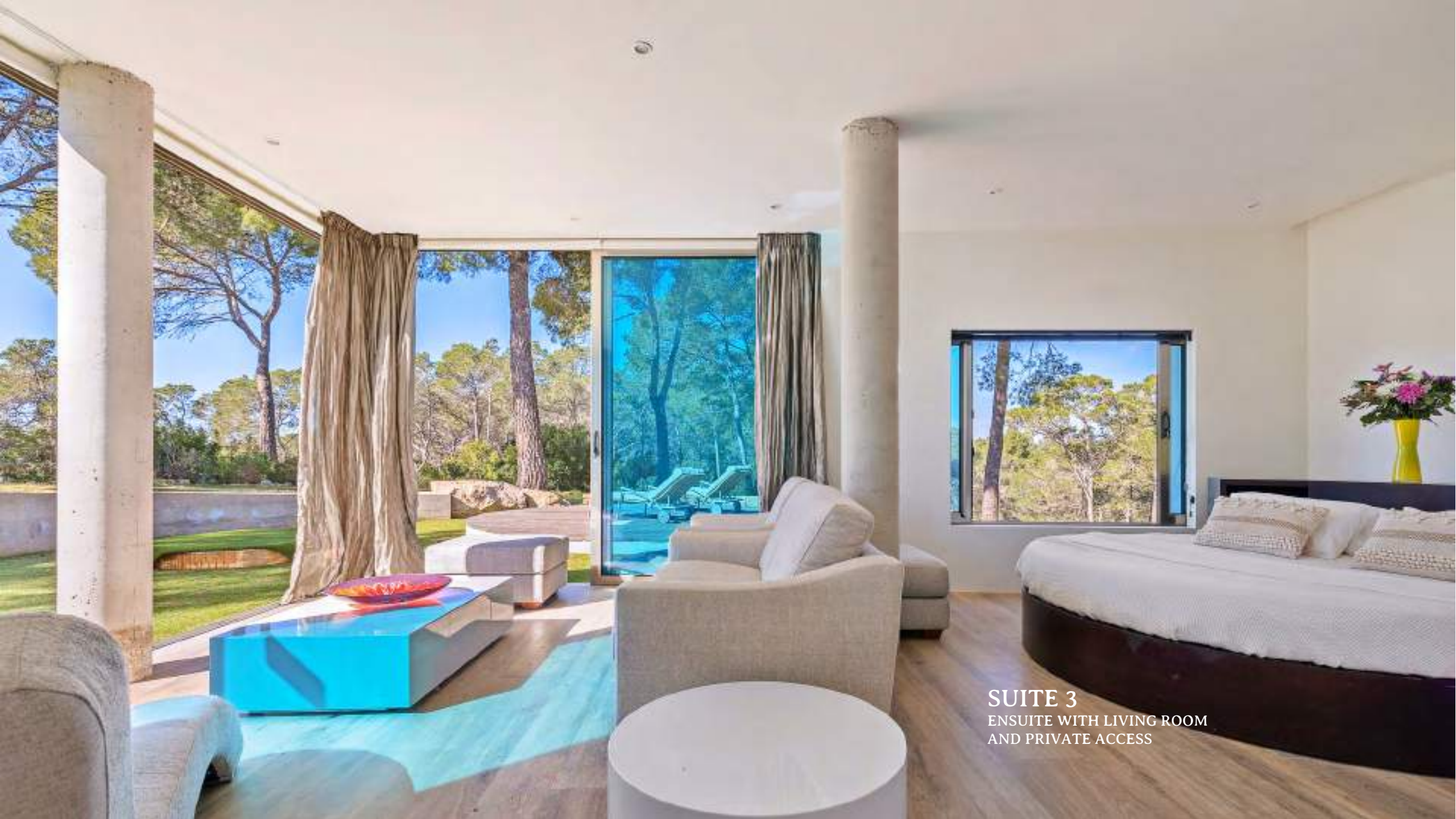
SUITE 3 ENSUITE WITH LIVING ROOM AND PRIVATE ACCESS