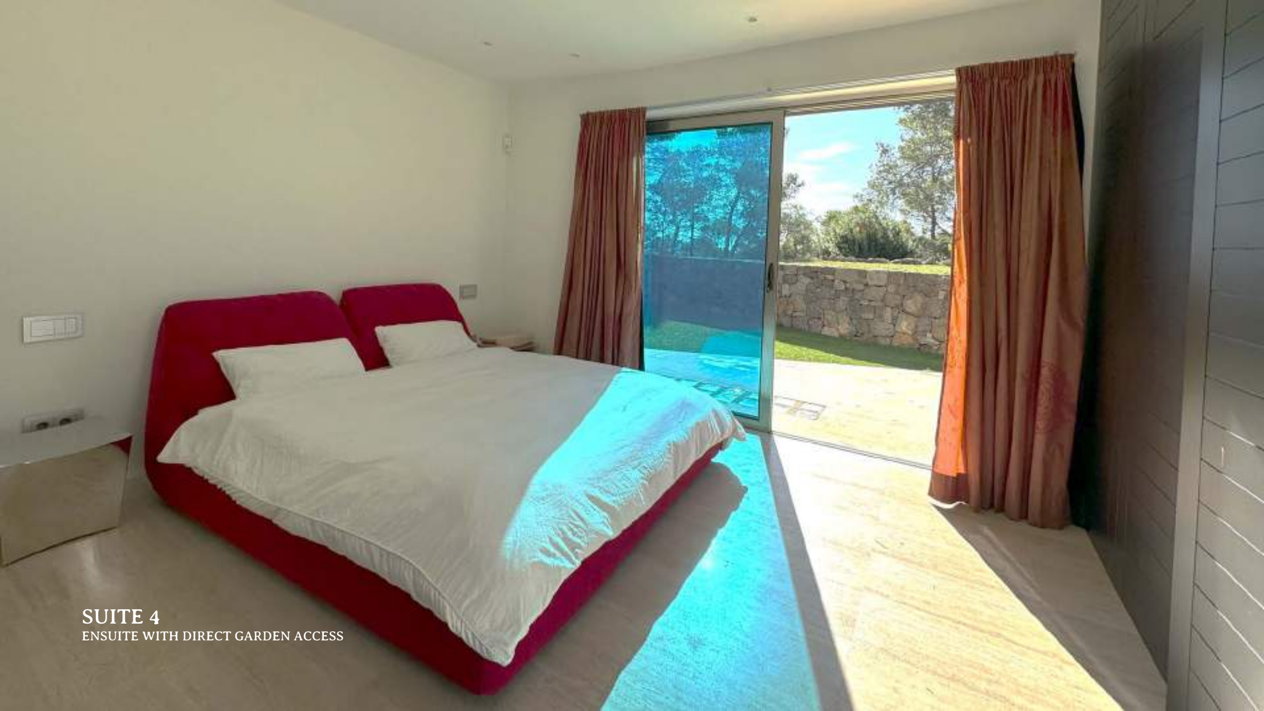
SUITE 4 ENSUITE WITH DIRECT GARDEN ACCESS